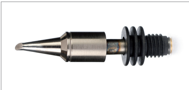
CT24 Technic 2.4 mm - Oblique Tip