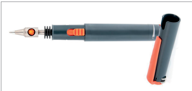
MK1-T Technic Soldering Iron with CT24