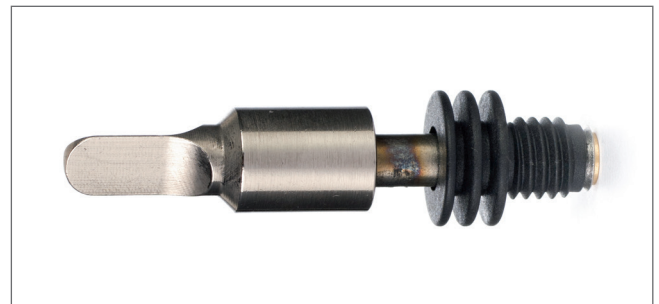
CT70 Technic Hot Knife Tip