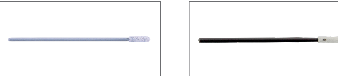
IT38540/100 - Head material: Nonwoven Polyester IT41050/100 - Head material: Polyurethane Foam Swab type: Sealed Polyester Swab type: Sealed Foam