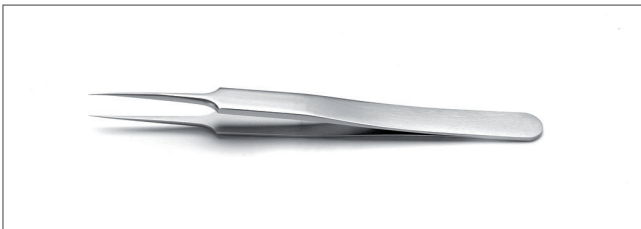
5.DX Tips: straight, extra fine, superior finish. OAL: 110mm