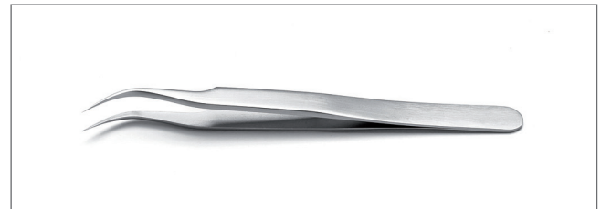
7.DX Tips: very fine, curved, superior finish. OAL: 120mm